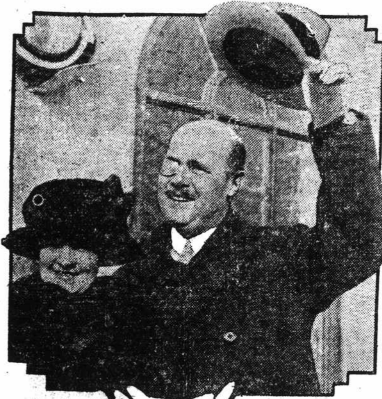
Princess Anastasia, the Cleveland-born wife of Prince Constantine of Greece, is shown here arriving in New York on the Olympic with her royal husband.