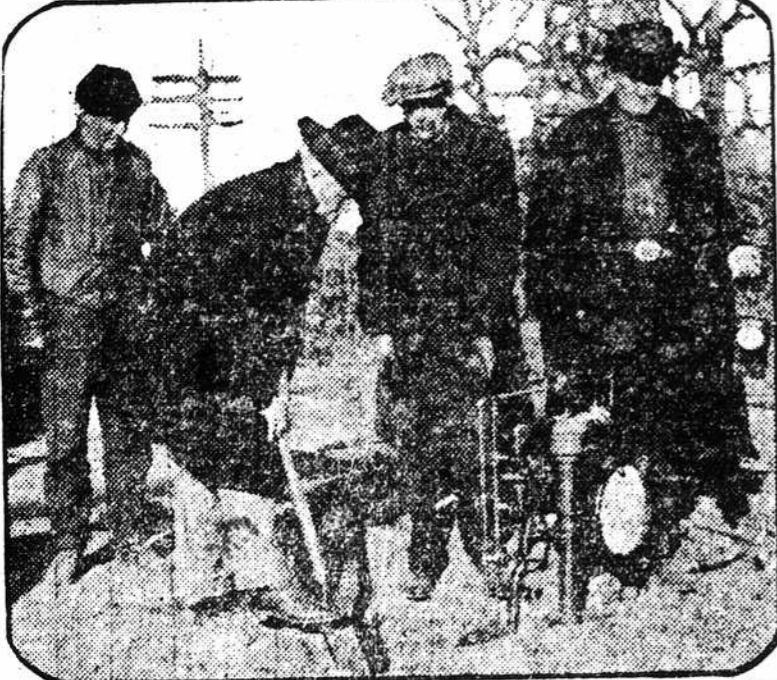
Cold weather and low gas pressure constitute a civic emergency according to Mayor W. E. Nicodemus of Drumright, Okla. So he gathered a committee of citizens and tapped a private main for general supply. Picture shows the committee at work, with the mayor second from the right.