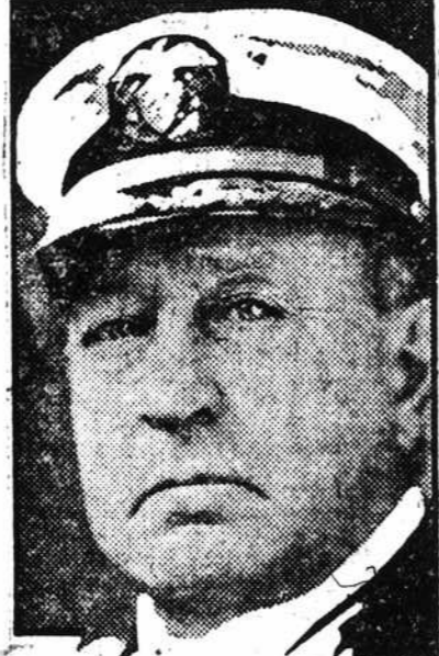
Uncle Sam's birthday present to Rear Admiral Hugh Rodman, above, commandant of the Norfolk navy yard, will be retirement of the admiral Jan. 6 from active service. Rodman will have been in the service more than 47 years when he celebrates his 65th birthday on that date.