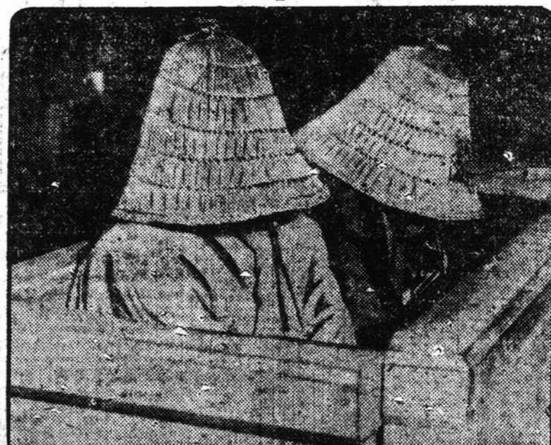
Here are two women on trial in a Japanese court. They have to wear baskets over their heads concealing their faces. So pretty faces don't move Nipponese judges and juries.