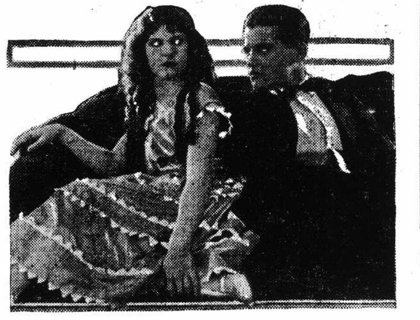
VIOLA DANA in THEY LIKE 'EM ROUGH Again Today at the Royal.

Lloyd's most pretentious comedy in a line-up of laugh-producing photoplays that have not had one mark against them. Lloyd's newest comedy is always a step forward, and "Grandma's Boy" is a mighty big stride ahead.