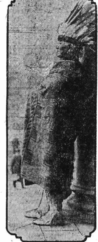
Wal-Hu-Sing (father of his people), the high priest of the Pueblo Indians of New Mexico, is shown here standing on the steps of City Hall, New York, apparently struck dumb by the grandeur of the city. The Indians were greeted by Mayor Hylan.