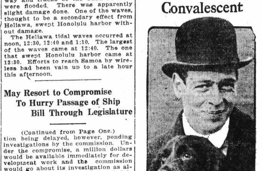
Prince George, youngest son of King George and Queen Mary, is shown here recovering from his recent operation for appendicitis. The photographer caught the prince with his pet dog, basking in the sun in Hyde Park.