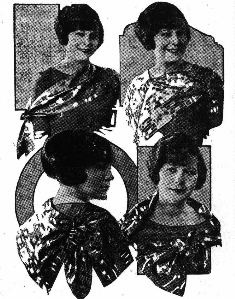
WEARING THE DEAUVILLE SCARF IN A FEW, AMONG THE MANY FASHIONS IN WHICH IT CAN BE DRAPED SO EFFECTIVELY.