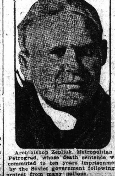
Archbishop Zephalak, Metropolitan of Petrograd, whose death sentence was commuted to ten years imprisonment by the Soviet government following a pagan to drive all organized religion from Russia.