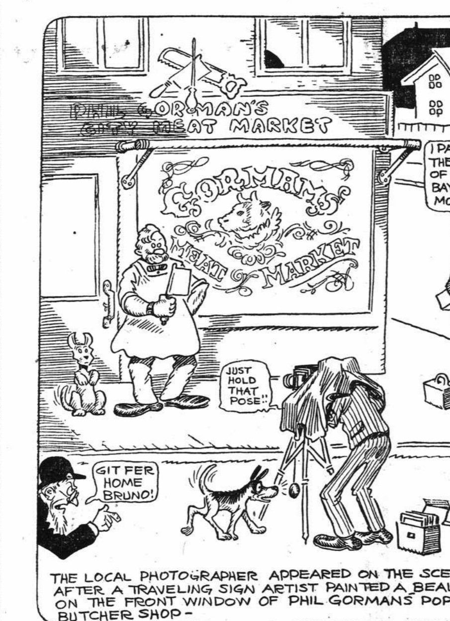
THE LOCAL PHOTOGRAPHER APPEARED ON THE SCENE, RIGHT AFTER A TRAVELING SIGN ARTIST PAINTED A BEAUTIFUL SIGN ON THE FRONT WINDOW OF PHIL GORMAN'S POPULAR BUTCHER SHOP—