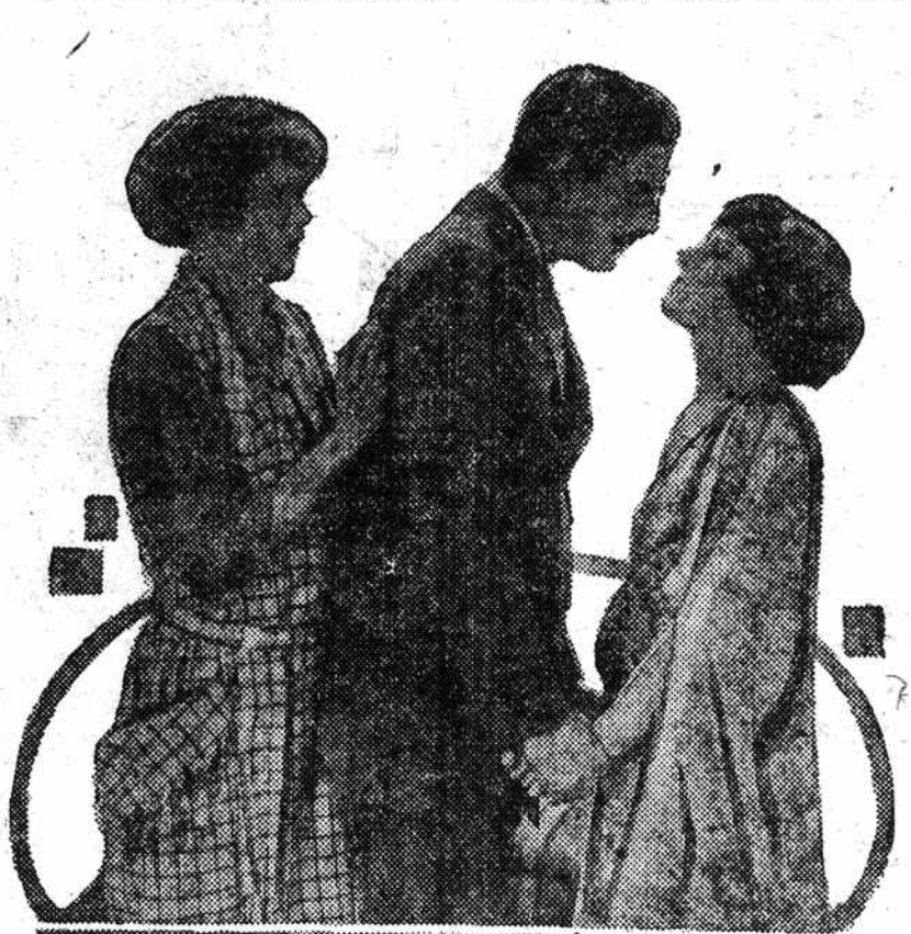
VIOLA DANA in "A NOISE IN NEWBORO"

of short tales by any debutante since Kipling's 'Plain Tales.'"