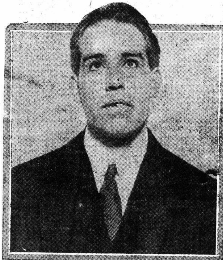
Winner of the Nobel prize for physics in 1922, Prof. Niels Bohr of the University of Copenhagen is giving six lectures at Yale University. The Danish scientist showed in his first lecture pictures of imaginary collisions between electrons and atoms. He explained that the bombardment these atoms and electrons gave each other confirmed his hypothesis of what happens when tiny particles of matter come together.