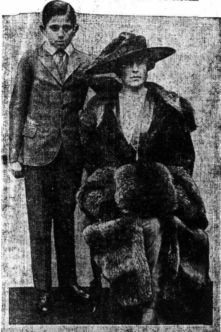
King Alfonso of Spain, accompanied by Queen Victoria and an entourage of grandees, admirals, generals and statesmen is making a visit to Rome. Photo shows Queen Victoria with her second son.