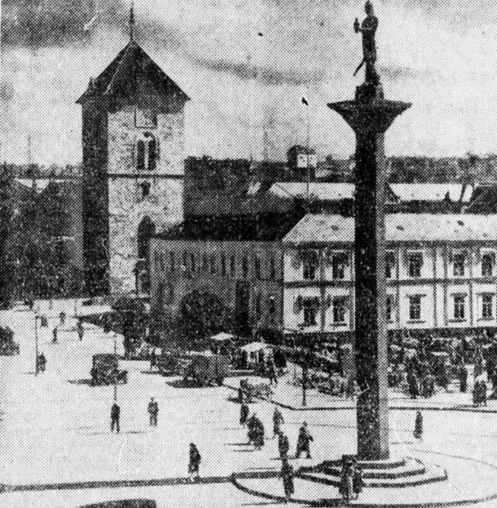
Here is a view of the beautiful city of Trondheim on the east coast of central Norway, which is reported to have been recaptured from the invading Germans by British landing parties yesterday. It was one of the first cities to fall to Germany in its lightning invasion of Scandinavia.

Norway Slated To Affirm Plans To Resist Germany