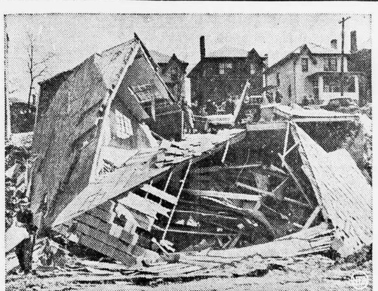
. . . the $12,000 structure rapidly disintegrated, collapsing into the heap of tangled wreckage seen above. Position of side wall at left shows house almost turned over in its fall.