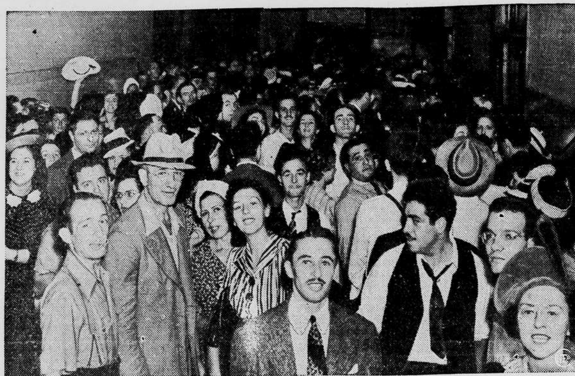
It may be just coincidence, but prospective exemption of married men from proposed conscription has been paralleled by a record rush for marriage licenses in many a U. S. community. Typical of the way many erstwhile confirmed bachelors suddenly took the plunge is this scene in the Brooklyn, N. Y., Marriage License Bureau.