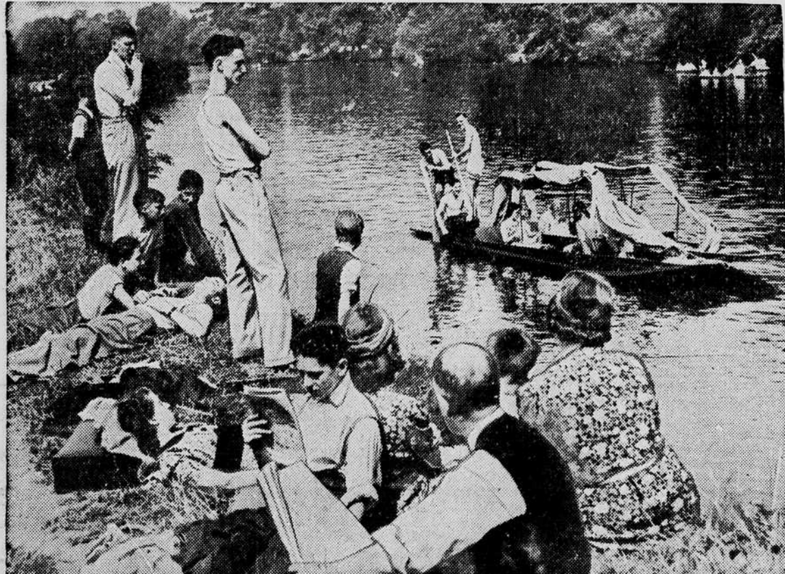
Although England's traditional August Holiday was permitted this year only to those engaged in non-essential work, some Britishers found it possible to relax despite momentary threats of bombing. With seaside beaches closed to them, the Thames seemed the next best thing. These holiday-makers at Runnymede, seem unworried by fear of German attack.