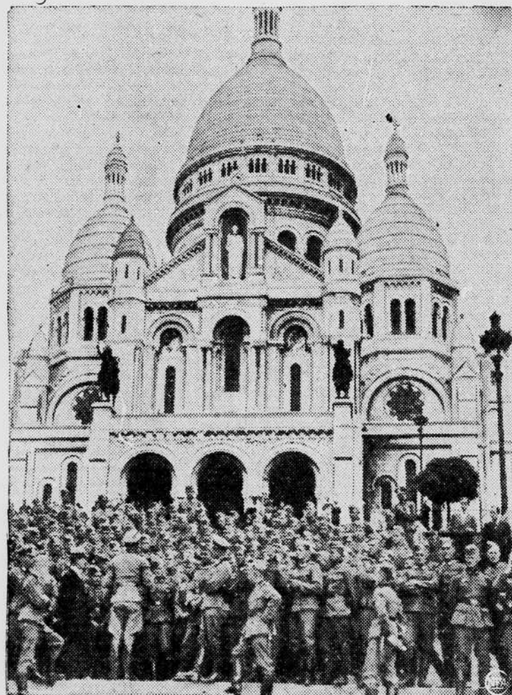
High atop the hill of Montmartre the famed Church of the Sacre Coeur affords a spectacular view of Paris, making it a mecca for Paris tourists. And the Nazis are no exception, as this group of sightseeing German soldiers shows.