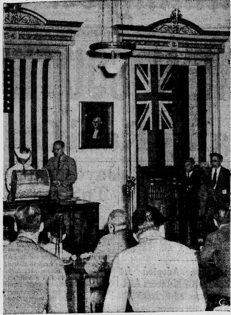
In the Honolulu palace which was the seat of the ruling monarchy before Hawaii became an American territory, Hawaii stages its lottery under the selective military training act. Governor Joseph B. Poindexter, who drew the first number, is at extreme right.