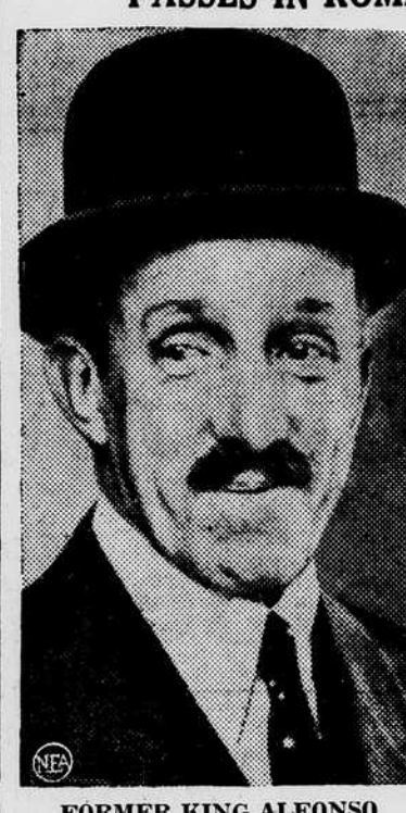
FORMER KING ALFONSO

defense contract shall be given beside the ancient kings of Spain