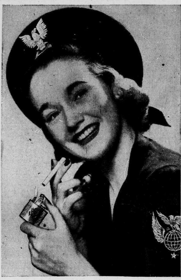
One way to be patriotic—and snap up your basic town outfit: a navy crepe dress, a perky little sailor, and a cigarette lighter—all bearing, as you may note, the military insignia.