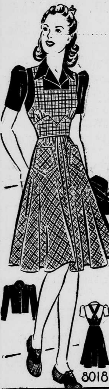
The dress which is practically a requirement for college entrance is the jumper. It's the basis of every well planned school wardrobe.

Pattern No. 8018 presents a jumper which slim girls will like—it has a fitted waistline, marked with a shaped, wide belt. The top is supported with straps which cross and button in back.