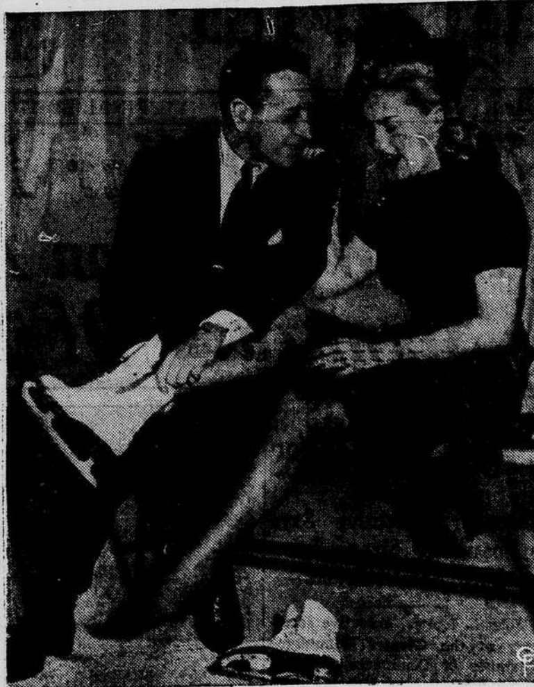
ACTOR GEORGE RAFT helps actress Betty Grable don her skates after attending a performance of the show, "It Happens on Ice," in New York. The couple's names have been linked romantically.