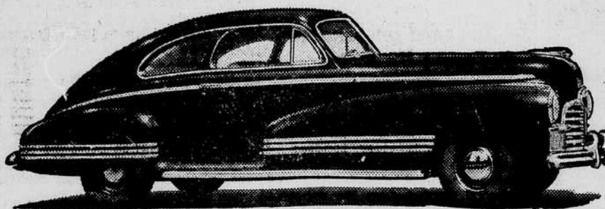
New streamlined Sedan Coupe in Pontiac's lowest-priced line.