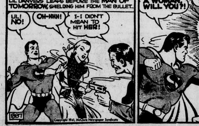
SUPERMAN AS RALPH ROLAND FIRES AT SUPERMAN, LIL DANNERS LEAPS BEFORE THE MAN OF TOMORROW, SHIELDING HIM FROM THE BULLET.