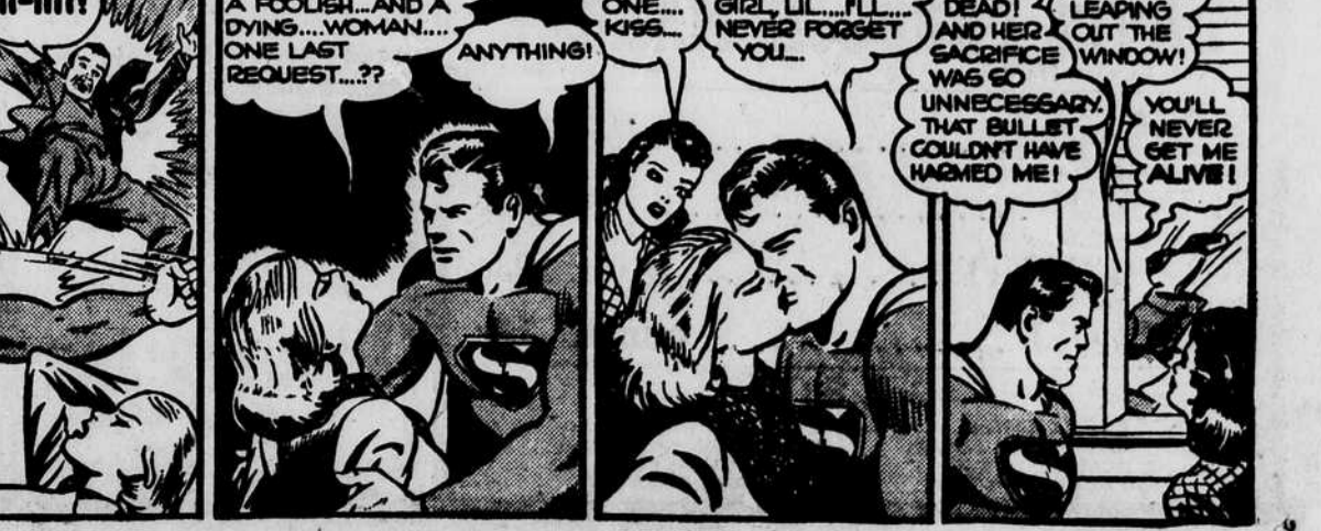
Dying Request By Jerry Siegel and Joe Shuster