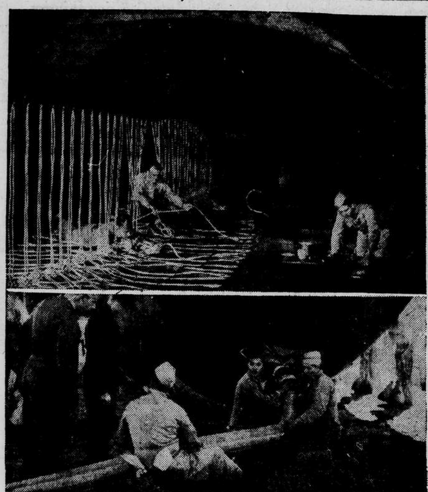
MARINES TRAIN IN USE OF BARRAGE BALLOONS

Efficiency of the barrage balloon in keeping Nazi planes high over London, thus lessening the bombers' accuracy, has resulted in the U. S. adopting the balloons as part of its war equipment. At the new training center at Parris Island, S. C., the West Point of the Marines, the leathernecks learn technique in handling the big bags. Top, left, Marines work inside the balloon. Bottom, left, a ground crew fills the big sausage with helium gas. Right, the balloon is "put to bed." One Marine stands near the sandbagged dugout, signaling to ground crew.