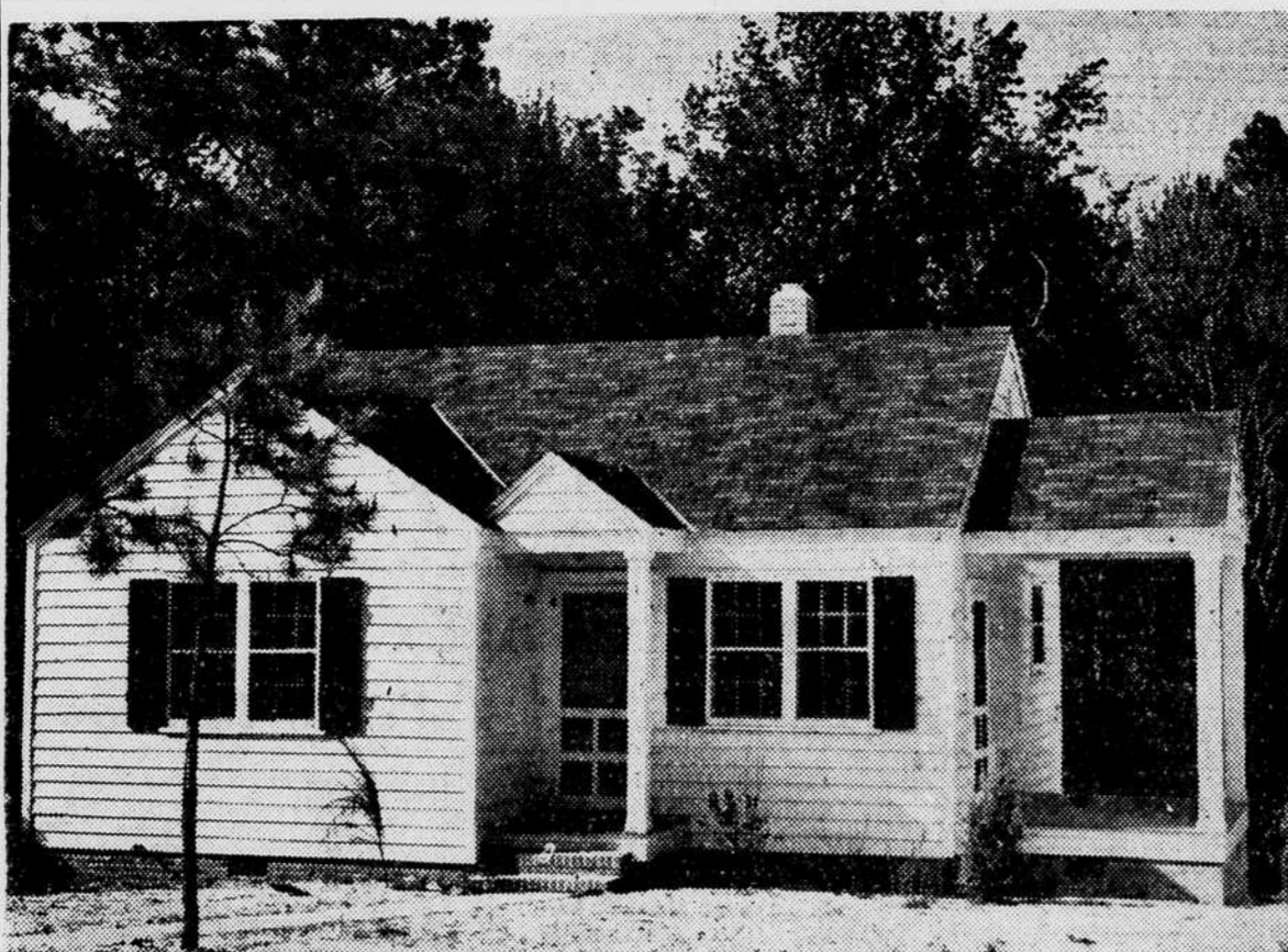
Shown here is a typical "Victory Home," which is helping answer the housing problem created by war activities in the Wilmington section. This home, located along with 80 other recently completed 5-room dwellings in the eastern section of the city just off Princess Street road, is offered for sale by Foster-Hill Realty Co.