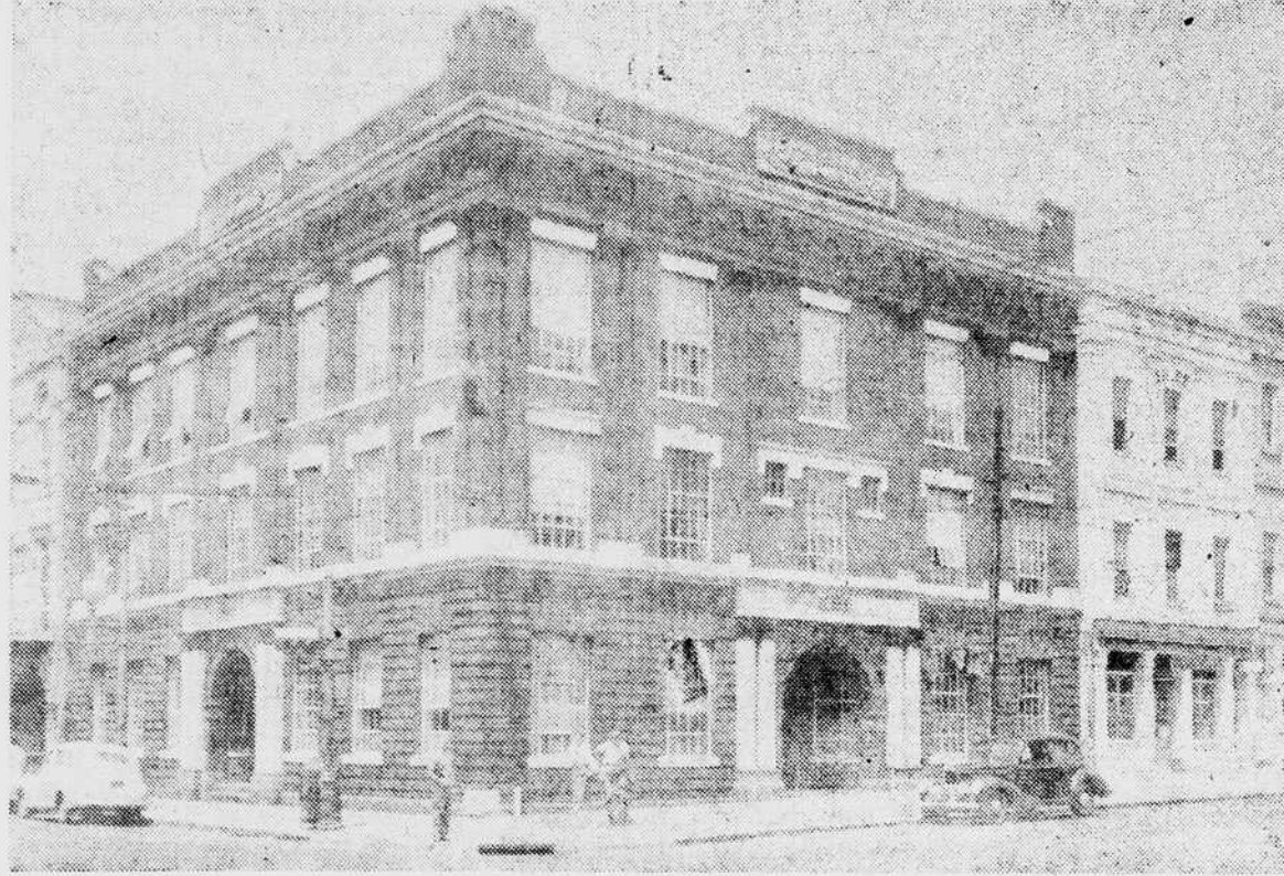
Home of Cape Fear Lodge No. 2 Independent Order of Odd Fellows

Cape Fear lodge has furnished 10 Grand Masters for the Grand Lodge of North Carolina.