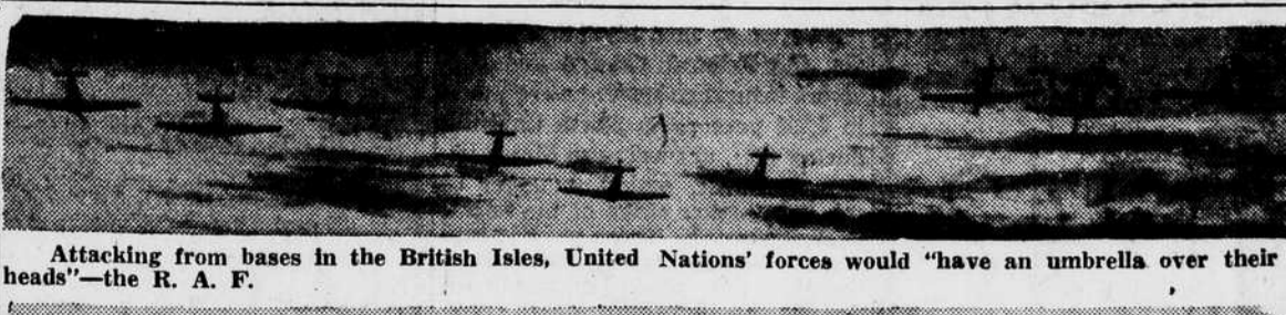
Attacking from bases in the British Isles, United Nations' forces would "have an umbrella over their heads"—the R. A. F.

WASHINGTON, May 23.—Recent events are seen by informed opinion here as pressing the United Nations inexorably to take one of the great calculated risks of military history.