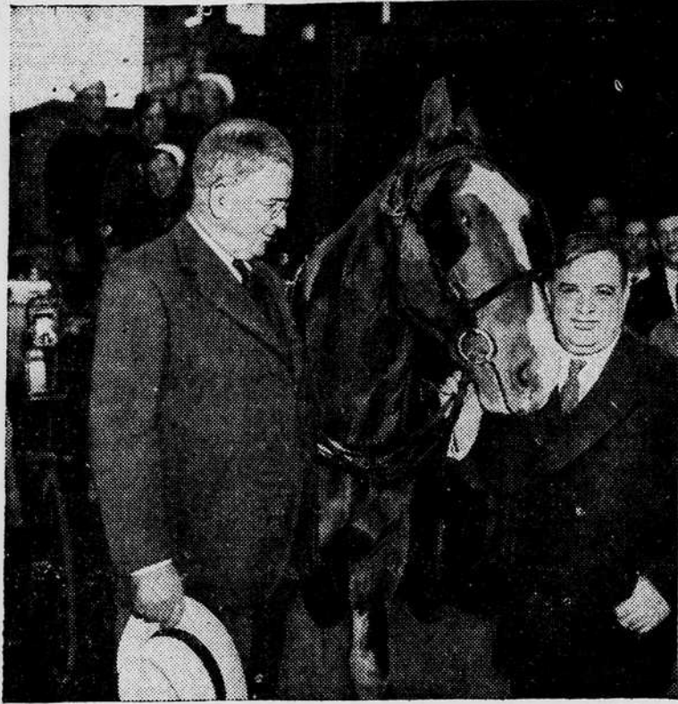
To emphasize possible stricter gasoline and oil rationing, Secretary of the Interior Harold L. Ickes (left) drove a horse-drawn carriage to New York hotel where he was met by Mayor Fiorello H. LaGuardia. Later, Ickes addressed the USO-Greater N. Y. Fund drive luncheon.