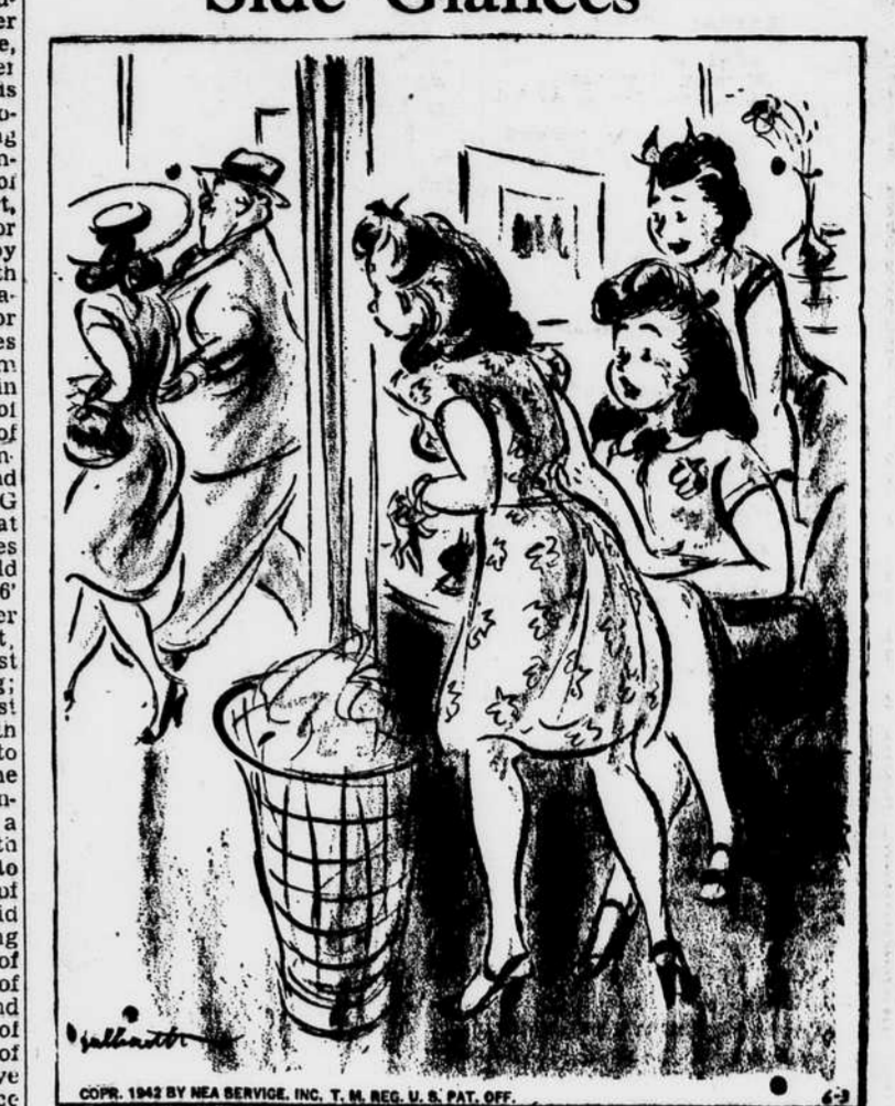
"We can stay out an hour extra today and get some shopping done—the boss is taking that new secretary to lunch!"

Gasoline loses 25 per cent less volume by evaporation in an aluminum tank than in a tank painted black.