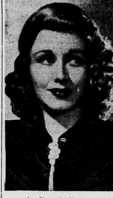
A Good Catch

Mannerheim will spend the day at army headquarters.