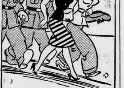
"They must be some of those 'fresh troops' you read about."