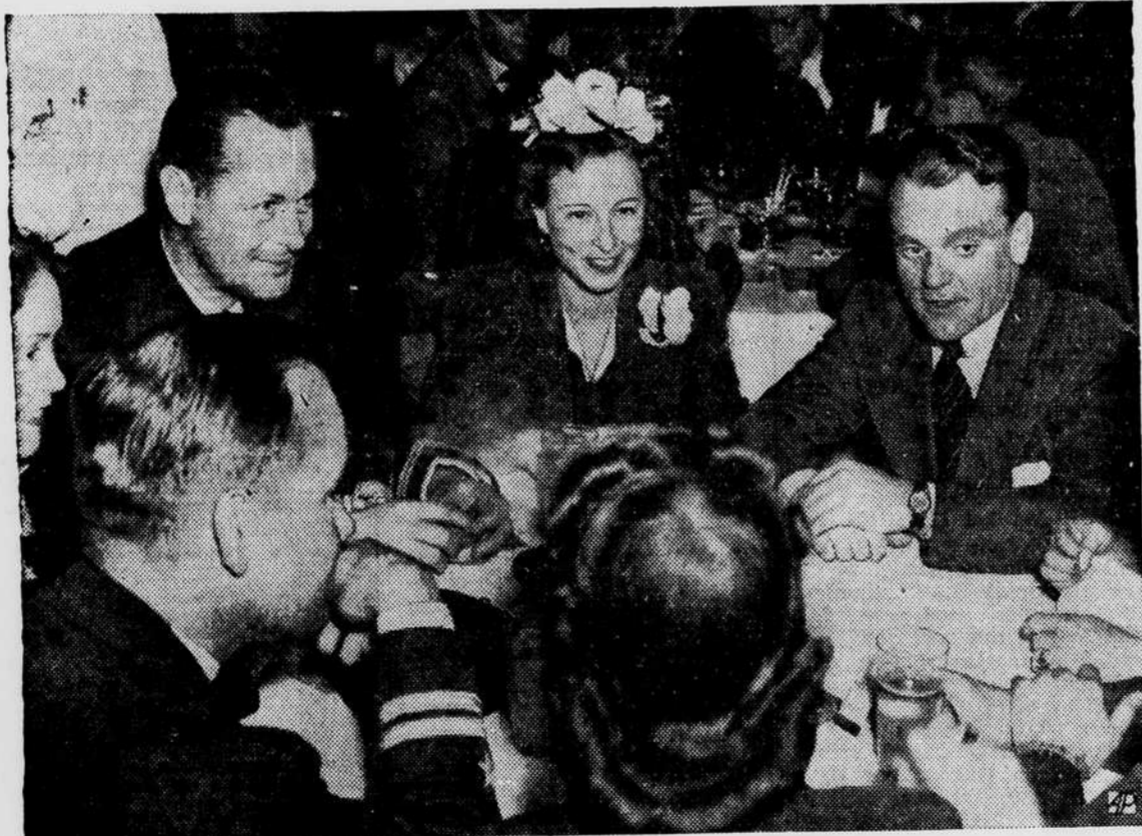
NAVY HERO WITH MOVIE STARS —Lt. John D. Bulkeley (foreground, hand to chin) sits with moviedom's Lt. Robert Montgomery (left) and Jimmy Cagney (right) at a night club.