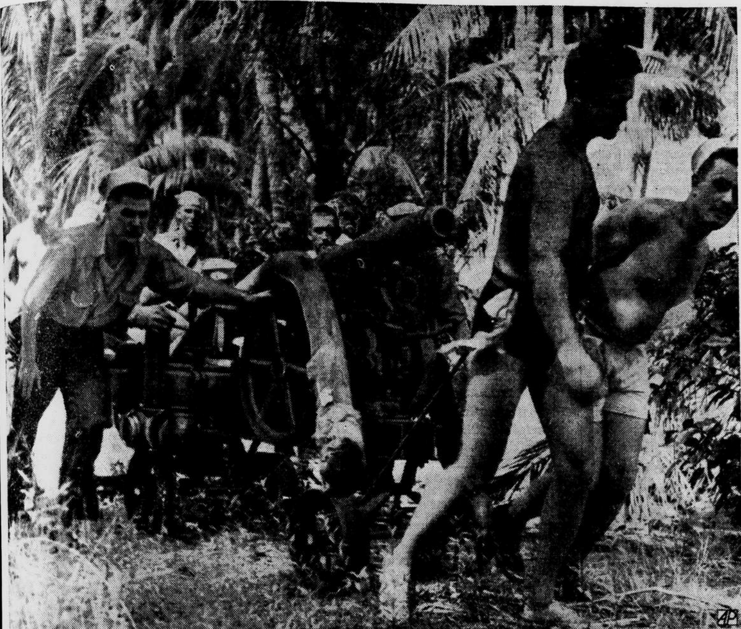
PULLING FOR UNCLE SAM —These sweating men pull a water pump through dense jungle as United States soldiers, sailors and marines build a base on a South Pacific island. Water pumps were used early in construction, later for fire fighting.