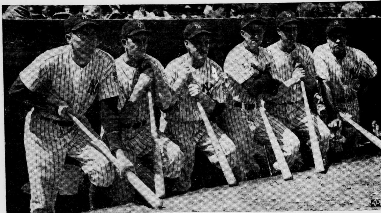
YANKEE "BIG BOYS" —These sluggers are keeping New York Yankees on top of the American League. Left to right: Catcher Bill Dickey, Second Baseman Joe Gordon, First Baseman Buddy Hassett, Outfielders Tommy Henrich, Joe DiMaggio, Charley Keller.