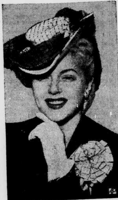
SALESWOMAN —Movie Actress Lana Turner, wearing war stamps corsage, sold war bonds and stamps at San Francisco, Calif., as part of a tour to boost Uncle Sam's treasury.