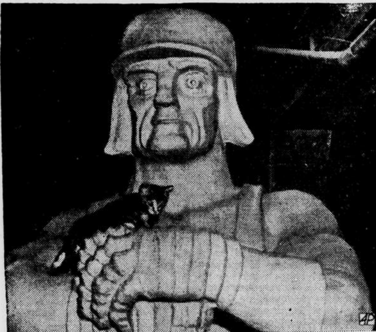
PUSSY'S NOT AFRAID —A cat climbs about unworried by the grim visage of this figure used in a New York war parade.