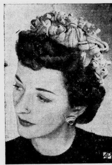
COTTON HAT —Here's a non-priority bonnet of flax colored cotton, twisted and strung with vari-shaped wooden beads.