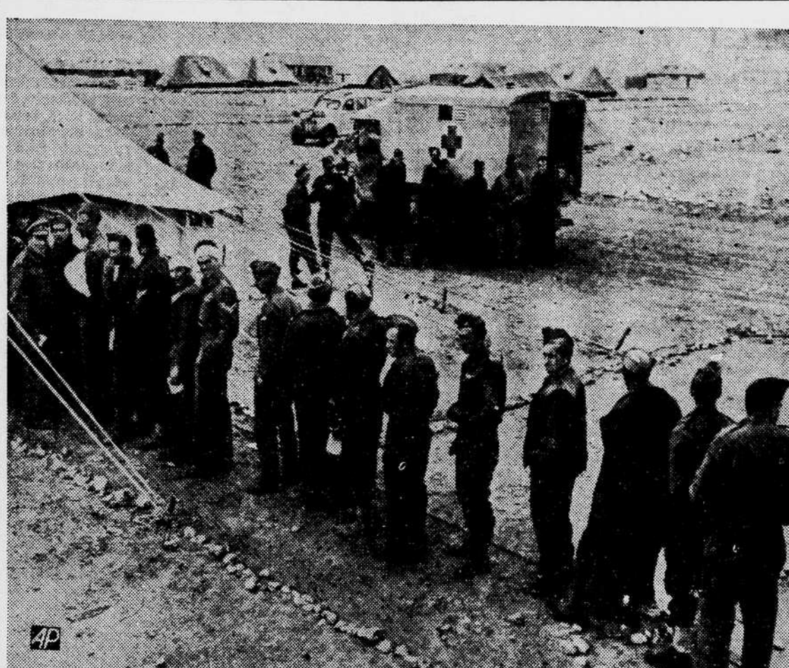
Only slightly wounded in the Libyan desert warfare, these British Empire soldiers were able to line up at a desert hospital inspection tent to report for treatment. A New Zealand unit operates the hospital.