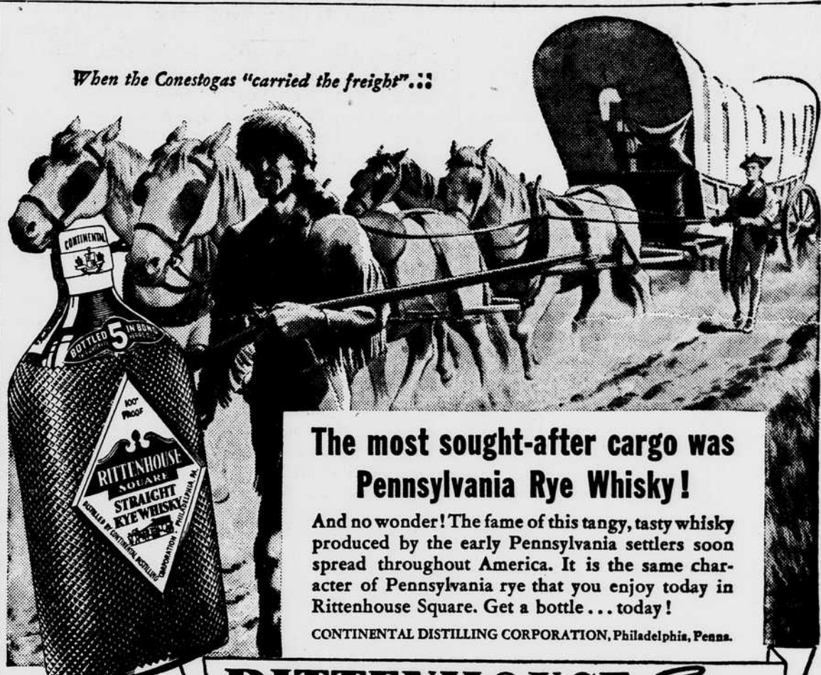
When the Conestogas "carried the freight"...