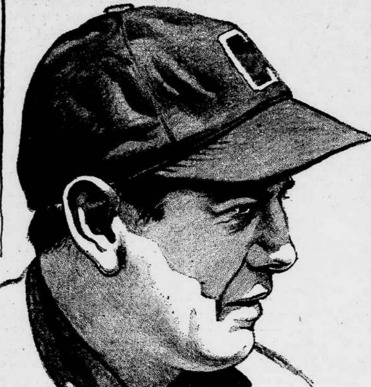
TED LYONS, CHICAGO WHITE SOX VETERAN PITCHER, WINNER OF 250 MAJOR LEAGUE GAMES