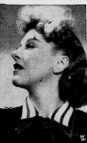
NICE NECKWORK. Care pays.

creases muscle tone and keeps the flesh flexible." The idea is to chew with a snapping motion, releasing the jaws suddenly and then snapping them closed abruptly. Massage is the last step. Hildegard says it's good for the neck