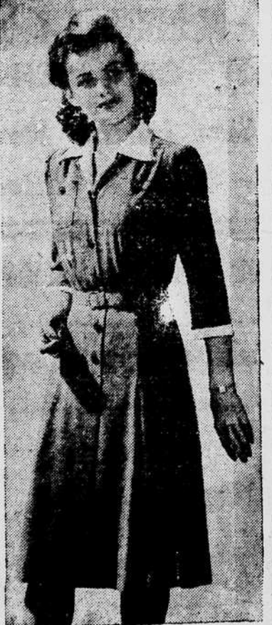
College entrance requirement: this Saco classic with launderable dickie and cuffs. Its tea yarn and rayon fabric promises warmth without weight—to save wool. Equally fitting for high school.