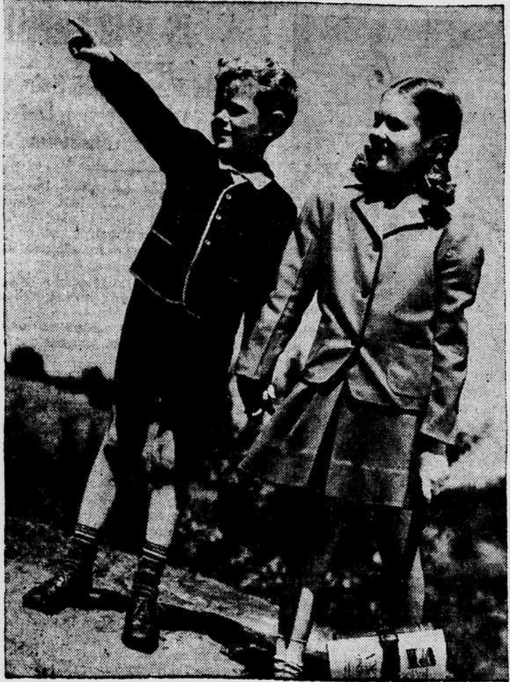
Brother-Sister act for back to school performance. Suits with blazer jackets, fashioned of soft Botany flannel favor trimly tailored lines, and lots of warmth-giving quality. Brother turns his shirt collar over a cardigan neckline; sister likes the added detail of notched lapels.

ORDER OF THE DAY Order of the Day, from Uncle Sam, is "Back to School" for all boys and girls, who must prepare now for their role during the peace that is to come. DARLING TRENCH COATS The trench coat for the school girl, from grade school up through college, is gaining favor as never before under the influence of the military. They are dashing in their casualness and eminently practical.