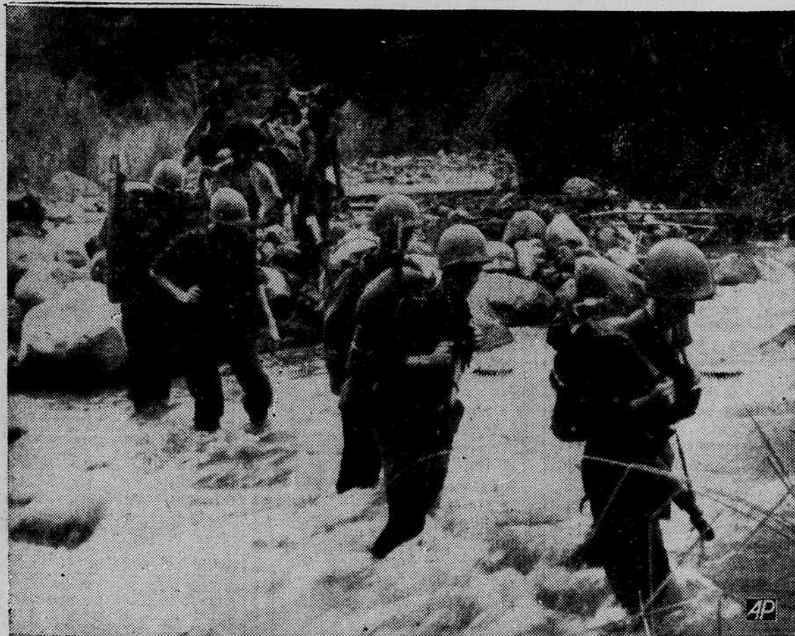
United States soldiers, laden with packs and followed by native porters, wade into a turbulent jungle stream in New Guinea in their advance toward Japanese bases on the northeastern shore of the island. Allied forces have driven a hole in Jap lines and have reached the beach near Buna, principal Japanese base in that area.