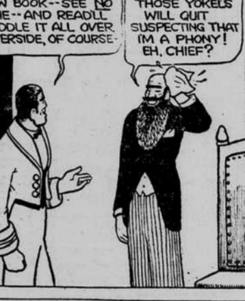
HA! HA! WHY THAT YOU'RE BUSY ON YOUR NEW BOOK—SEE NO ONE—AND READ! PEOPLES IT ALL OVER ROVERDEE, OF COURSE.