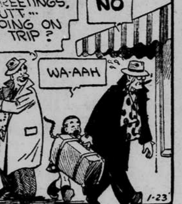
GREETINGS, TUTT... GOING ON A TRIP? WA-AAH