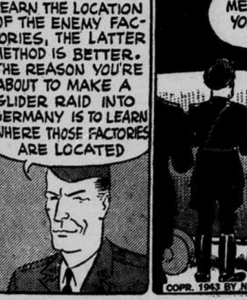
T. M. REG. U. S. PAT. OFF.