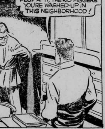
I SEZ HELLO T' THE DOC AND HE DON'T EVEN KNOW ME.