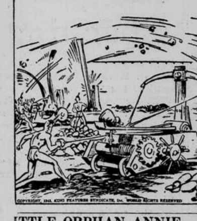
THONG'S GREAT CATAPULTS HURL A BARRAGE OF STONES AGAINST THE PARAPETS