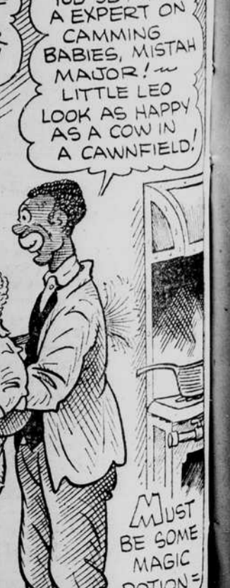
MUST BE SOME MAGIC POTION!