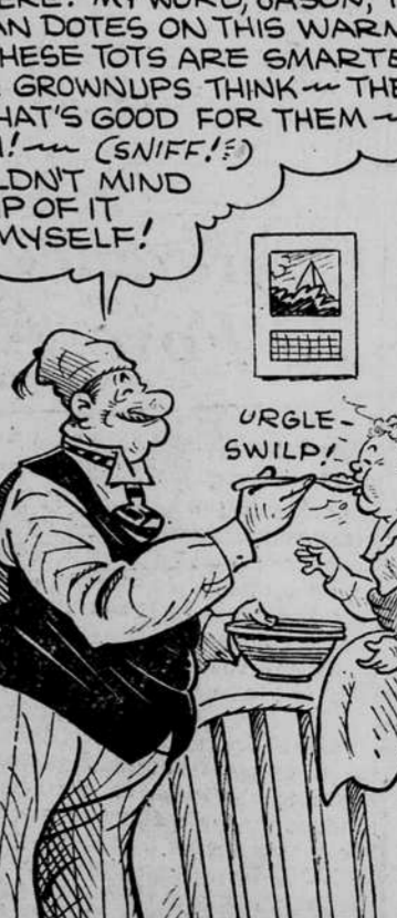
THERE, THERE! MY WORD, JASON, THE LITTLE MAN DOTES ON THIS WARM DISH! THESE TOTS ARE SMARTER THAN WE GROWNUPS THINK—THEY KNOW WHAT'S GOOD FOR THEM—HEH HEH! (SNIFFS)