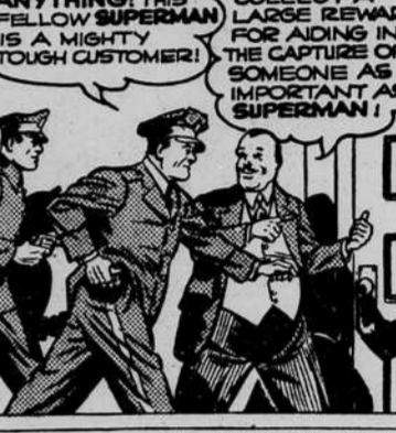
I OUGHT TO COLLECT A LARGE REWARD FOR AIDING IN THE CAPTURE OF SOMEONE AS IMPORTANT AS SUPERMAN!