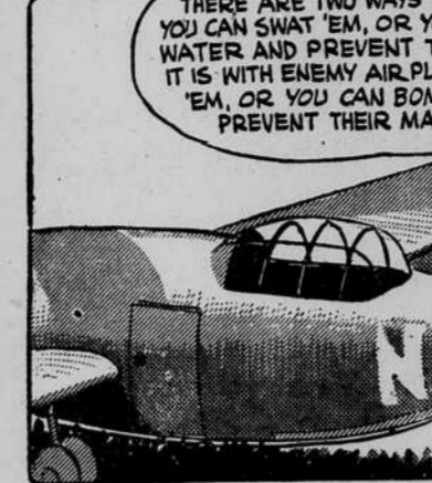
THERE ARE TWO WAYS TO KILL MOSQUITOES—YOU CAN SWAT 'EM, OR YOU CAN POUR OIL ON WATER AND PREVENT THEIR HATCHING. SO IT IS WITH ENEMY AIRPLANES—YOU CAN SHOOT 'EM, OR YOU CAN BOMB FACTORIES AND PREVENT THEIR MANUFACTURE