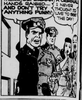
SUPERMAN! I NEVER THOUGHT YOU'D STARTED TO LIVE TO SEE THE DAY!