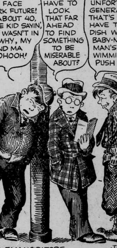
OH, I DON'T KNOW HOW I KIN FACE SUCH A DARK FUTURE! WHEN I'M ABOUT 40, SOME LITTLE KID SAYIN', "WHUT, YOU WASN'T IN TH' WAR? WHY, MY GRAMA AND MA WAS!"—OOHO!