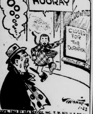
CLOSED TO THE DURHAM