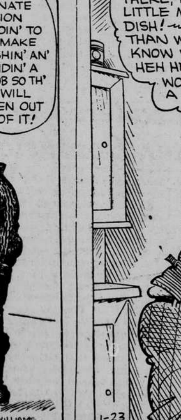
WE'RE THAT UNFORTUNATE GENERATION THAT'S GOIN' TO HAVE TO MAKE DISH WASHIN' AN' BABY-MINDIN' A MAN'S JOB SO TH' WIMMIN WILL PUSH MEN OUT OF IT!