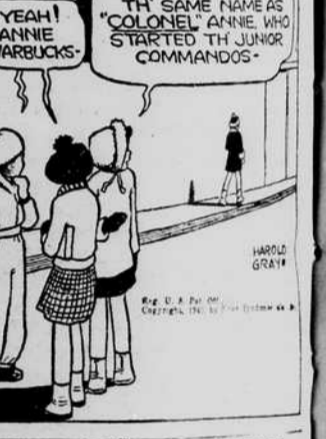
ANNIE WARBUCKS? SAID—Y—Y—THAT'S THE SAME NAME AS "COLONEL" ANNIE WHO STARTED THE JUNIOR COMMANDOS?