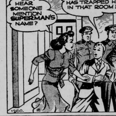
DO I HEAR SOMEONE MENTION SUPERMAN'S NAME?