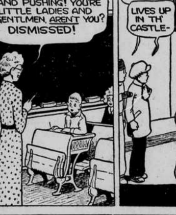
NOW, CHILDREN! REMEMBER! NO RACING AND PUSHING! YOU'RE LITTLE LADIES AND GENTLEMEN, AREN'T YOU? DISMISSED!