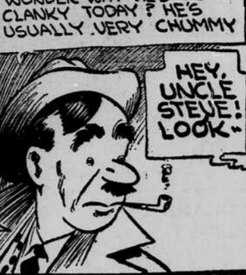
HEY, UNCLE STEVE! LOOK!