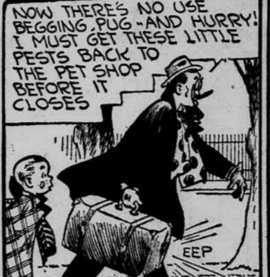
Now there's no use begging, pug—and hurry! Must get these little pests back to the pet shop before it closes.