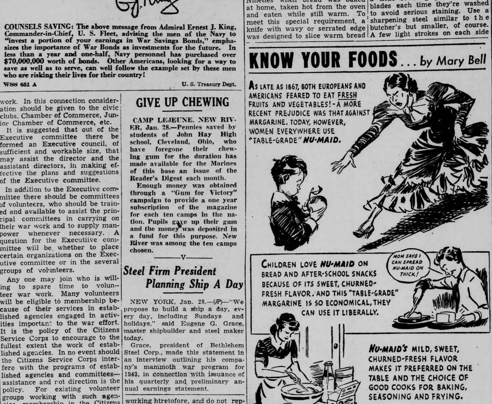
TABLE-GRADE" NU-MAID IS 97% DIGESTIBLE, RICH IN THE "PEP-UP" VITAMIN"A", AND A HIGH ENERGY FOOD (3,300 CALORIES PER LB.) TRY NU-MAID TODAY -- YOU'LL LIKE IT.