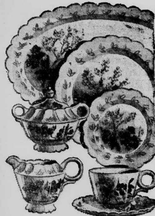
(Merchandise advertised is not same as above illustration)

Fluted edge with red sail ship center on white body. The set consists of 6 breakfast plates, 6 bread and butter plates, 6 fruits, 6 cups, 6 saucers, 1 nappy, 1 platter, 1 sugar, 1 creamer.