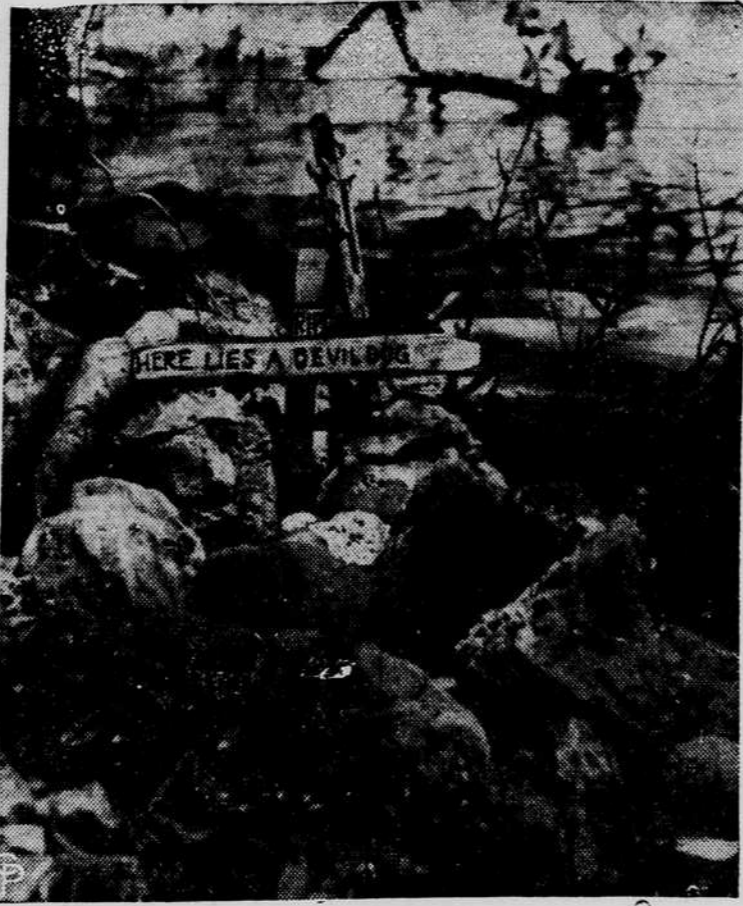
MARKED BY A WOODEN CROSS and the barrel section of a broken rifle is this grave of an unknown U. S. Marine, killed on the Matankauk River bank on Guadalcanal. The epitaph on the cross reads: "R. I. P.—Here Lies a Devildog."