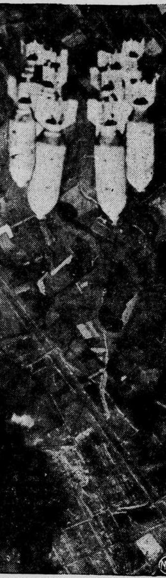
Stick of 10 neatly bunched bombs held for a target at Huls, Germany, during Flying Fortress raid on the Ruhr.