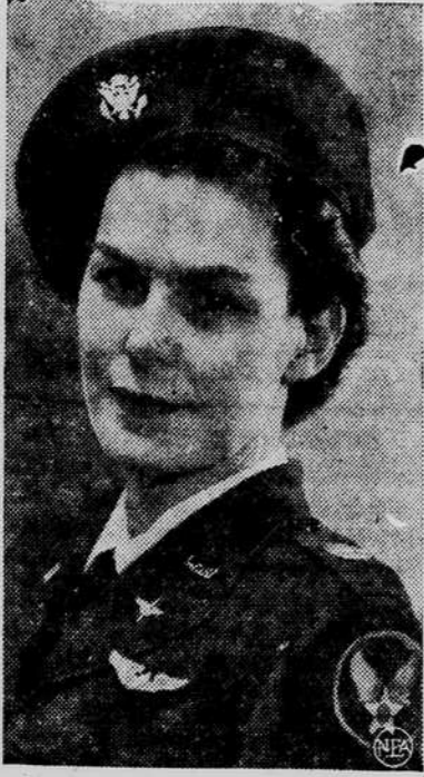
Jaunty beret and blue jacket and slacks form the new uniform of the WASPs (Women's Airforce Service Pilots), who ferry aircraft in the U. S. and Canada.