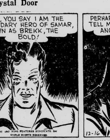
IKKI, TO MY ASSOCIATES AND IN MY TIME, I AM KNOWN AS YET, YOU SAY I AM THE LEGENDARY HERO OF SAMAR KNOWN AS BREKK, THE BOLD!