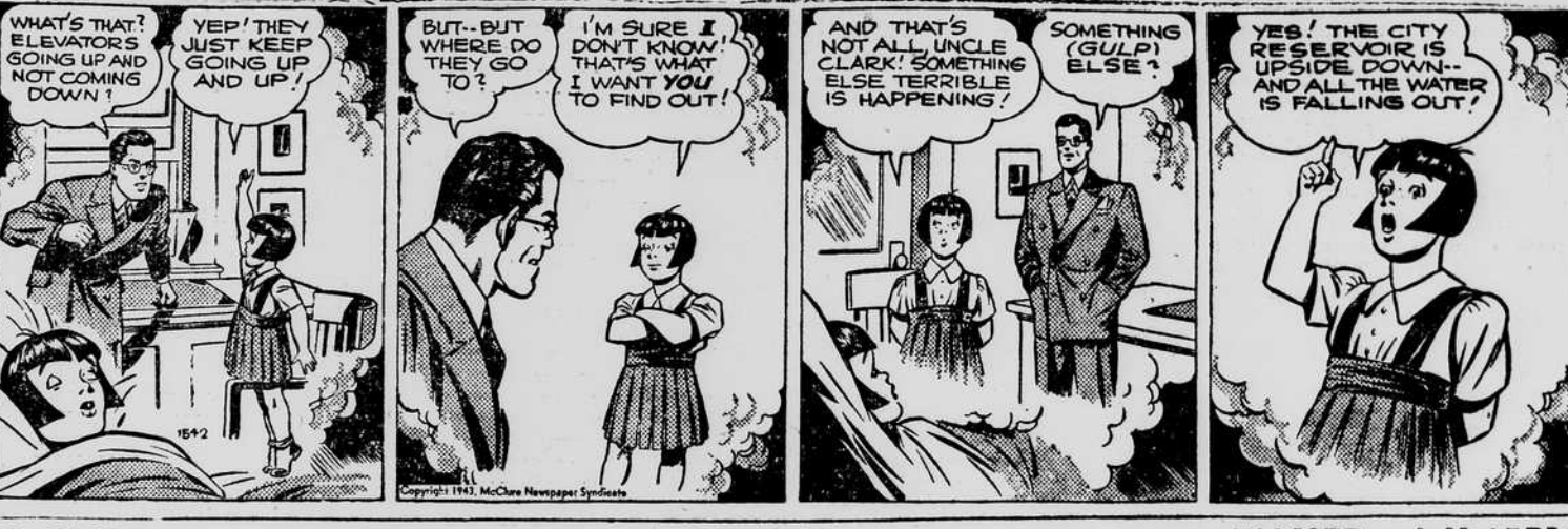
By JERRY SIEGEL and JOE SHUSTER