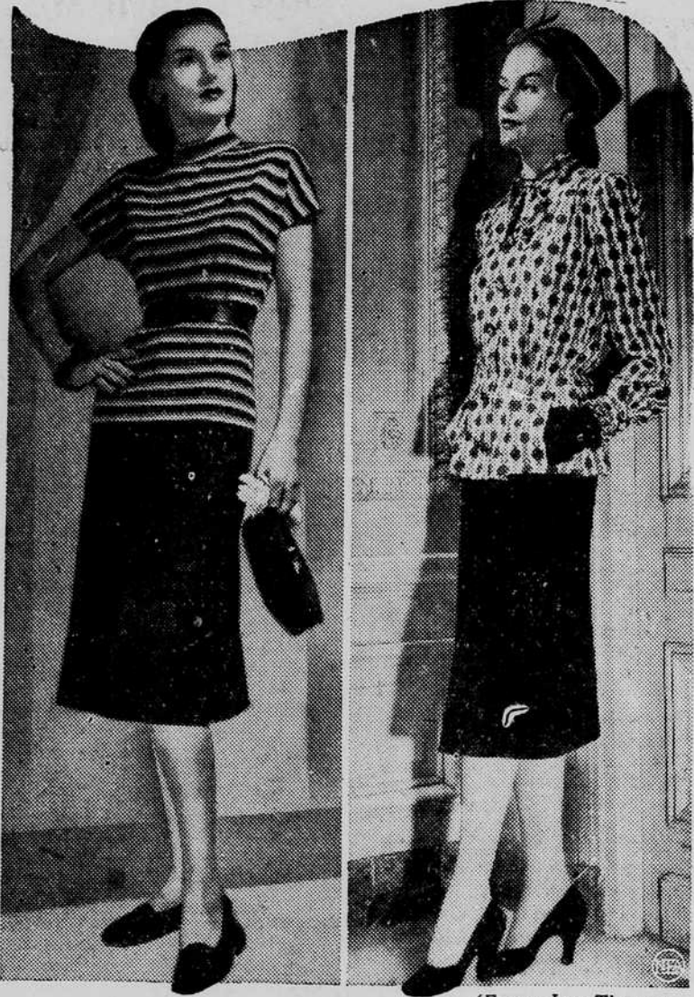
Typical of today's high-necked, short-sleeved jumper style is the two-piece jersey outfit (left) with navy blue skirt and leather belted blouse of horizontal pink and blue stripes. The Russian style overblouse of red and white print, worn with a black crepe skirt (right), is another version of the new long look.

Two dances will be given this week at the Woodrow Wilson hut in Wilmington, one this evening when Battery A of the 138th AA Gun Battalion entertains and again on Friday night with the Headquarters battery of the 361st as hosts. Music for both these dances as well as the Saturday evening open house will be furnished by the 11th Army band.