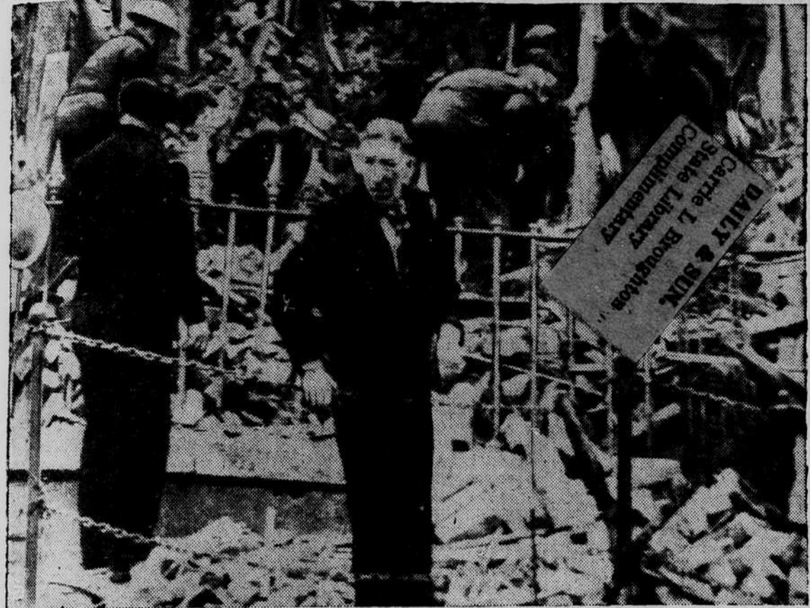
Rescue workers dig through the wreckage of a south England house for a family that was thought to be buried in the ruins after one of Germany's new pilotless plane-bombs exploded against the structure.