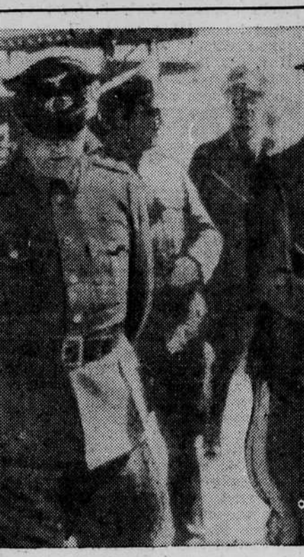
German caption on this picture just received from Stockholm says Field Marshal Rommel, second from right, is inspecting catapult battery similar to ones which fired radio-controlled robots at shores of England.