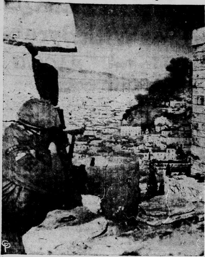
A British paratrooper fires on Greek rebel snipers, during an engagement between the British and the ELAS, from a position inside the Acropolis, ancient landmark of Athens. Not the smoke billows rising from a building set afire in the fighting.