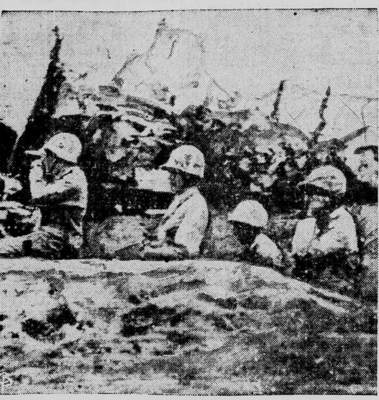
AGAINST A BACKGROUND of wrecked enemy planes, U. S. Marine spotters are directing artillery fire from a shell-hole command post on the north side of the Iwo Jima airstrip after its capture by the Leathernecks. The Third Marine Division is mopping up the central airfield on the volcanic island.