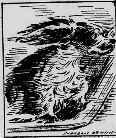
"He" hop on the running board of a car.

When Van Buren was President the war with the Seminole Indians was at its height. (Incidentally this country is still technically at war with this tribe of Indians, a formal peace treaty or armistice never having been signed.) Van Buren was persuaded to try bloodhounds in tracking down the Indians in the