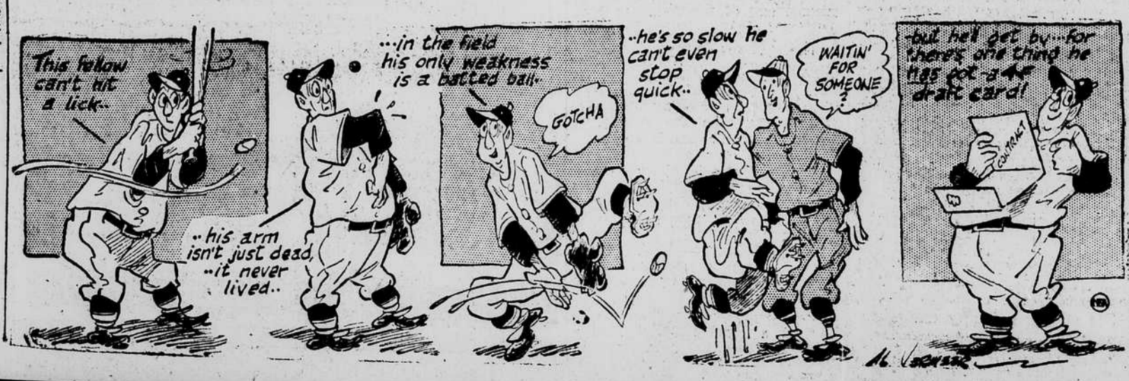
And That's What Counts! ...in the field his only weakness is a batted ball. GOCHA ...his arm isn't just dead - it never lived. ...he's so slow he can't even stop quick. WAIT! SOMEONE! but he'll get by...for there's one thing he has got - a 4-4 draft card!