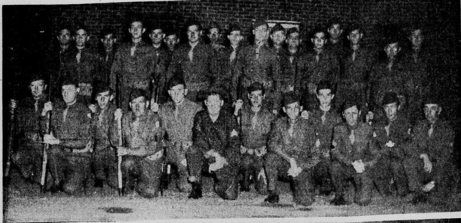
Members of the Wilmington Unit, First Company, Second Battalion, Third Regiment of the North Carolina State Guard are shown in the top photograph.