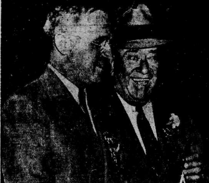
TOM Pendergast, right, Missouri "boss," paved Truman's political road. They're shown together at 1936 Dem. convention.