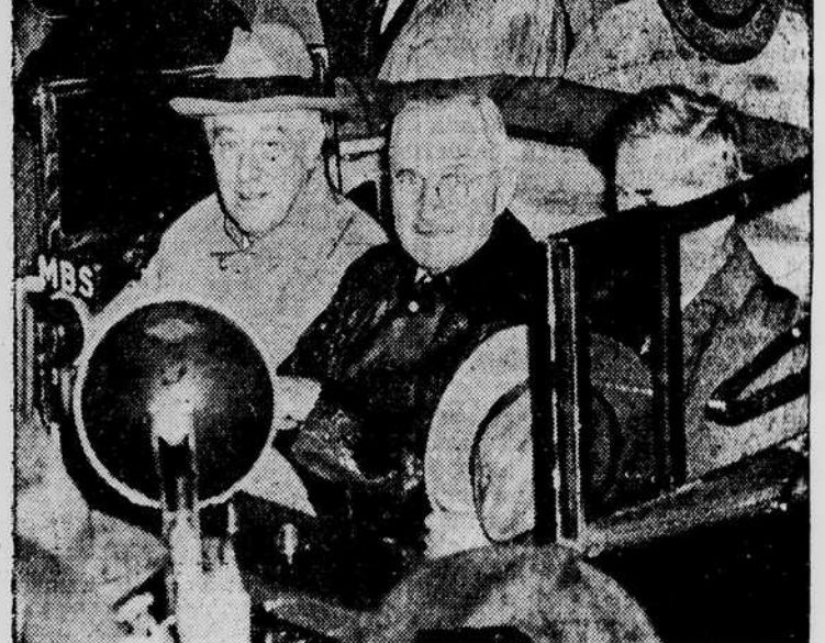
ROOSEVELT wins Fourth Term in 1944 and Truman wins Vice Presidency. Above, they return triumphantly to Washington.

Reproduction in whole or in part prohibited except by permission of NEA Service, Inc.—Printed in U. S. A.