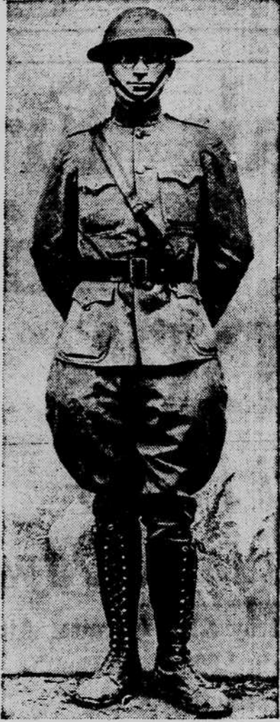
SERVED as Captain in World War I; later became a Major.