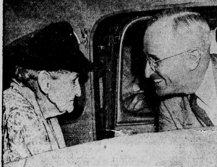
MOTHER Martha E. Truman keenly follows son's climb up the political ladder. Here, they chat at a National Convention.