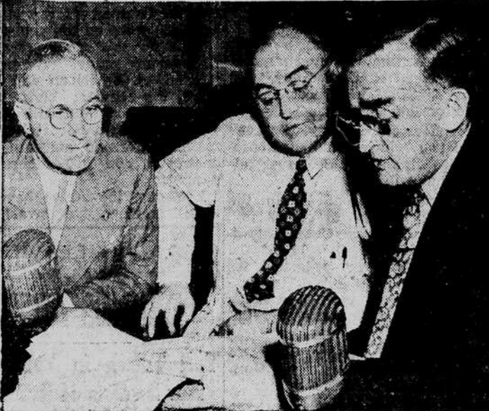
TRUMAN, Kilgore and O'Mahoney—they investigated the war effort. It was then that Truman caught nation's fancy.