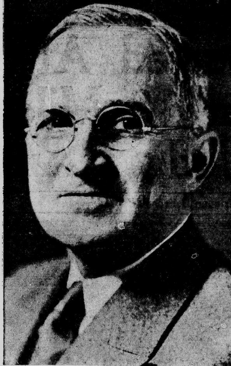
HARRY S. TRUMAN, thirty-second President of United States.