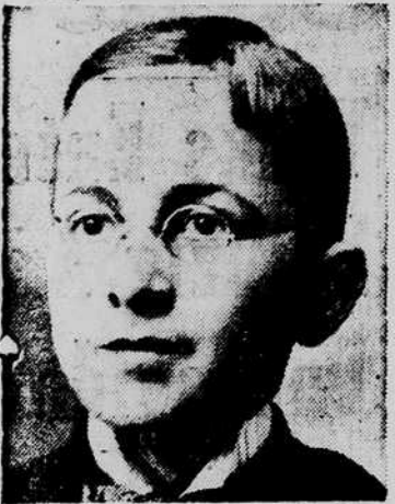
DONNED glasses early in life; poses for schoolboy picture.