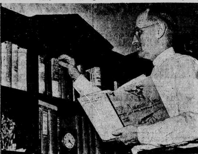
RESEARCH helped Truman attain fame as prober when elected to Senate, 1934. Started political career as judge, 1922.