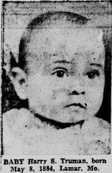
BABY Harry S. Truman, born May 8, 1884, Lamar, Mo.