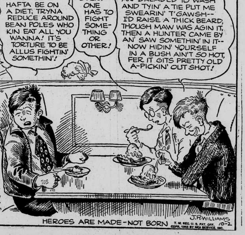
OUR BOARDING HOUSE ... with ... MAJOR HOOPLE By J. R. WILLIAMS