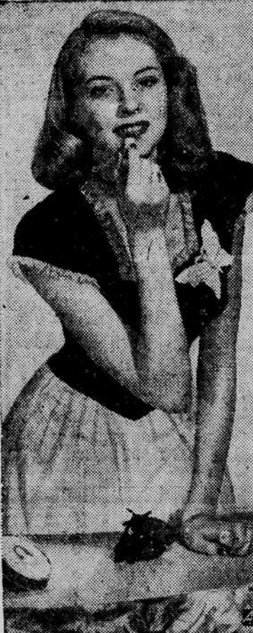
A STRAWBERRY AND CREAM complexion can be achieved with makeup properly applied.

This method of making up, if done properly, will make your complexion look natural. If you use an eyebrow pencil, you should