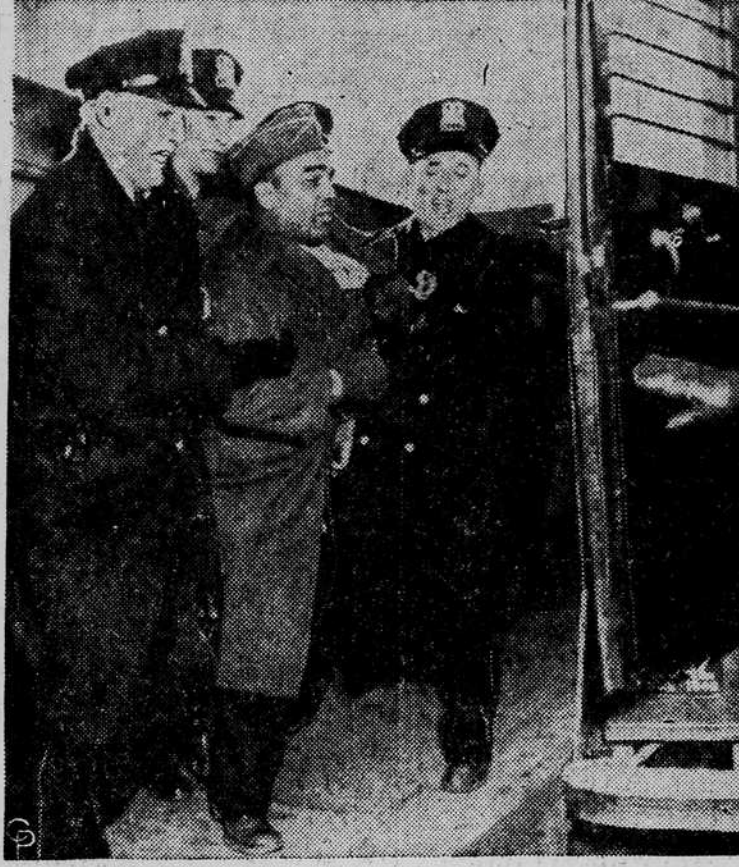
WELL ESCORTED by Chicago policemen, a meat packer strike picket wearing an army uniform, is bundled off to the patrol wagon after attempting to keep cars and trucks from entering the plant grounds of the Union Stockyards. Fact-finder Edwin E. Witte continues conferences although he thinks chances for any early settlement are slight.