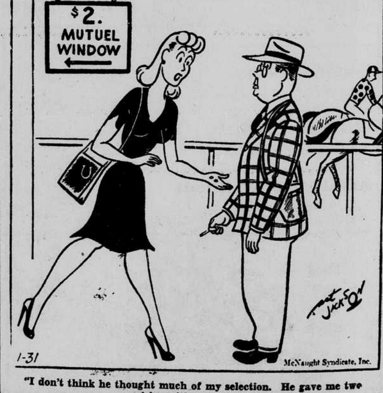
"I don't think he thought much of my selection. He gave me two aspirins with my change!"

CRYPTOQUOTE—A cryptogram quotation VXB XNRR OIB HBOIBAV QXNWX MDI WXNRHNA XUBV XOTB WRNYF BH VXB BOIRBAV—QXNVVNB L Yesterday's Cryptoquote: TRUTH IS THE STRONG THING LET MAN'S LIFE BE TRUE!—BROWNING. Distributed by King Features Syndicate, Inc.